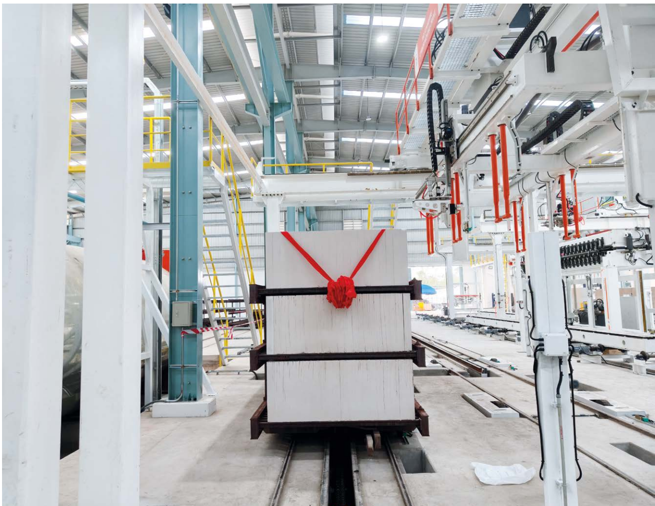
7.0/7.5cm thin product solution-remarkable for the Thai market.

The successful trial production of the Thailand Diamond project demonstrates Teeyer Intelligent's capabilities in AAC equipment manufacturing and contributes to the growing presence of Chinese high-end manufacturing in international markets. In line with the Belt and Road Initiative, the company plans to continue its global expansion by applying its research and development experience. With integrated solutions, Teeyer Intelligent aims to support overseas markets in adopting more sustainable and digital practices in the autoclaved aerated concrete industry.