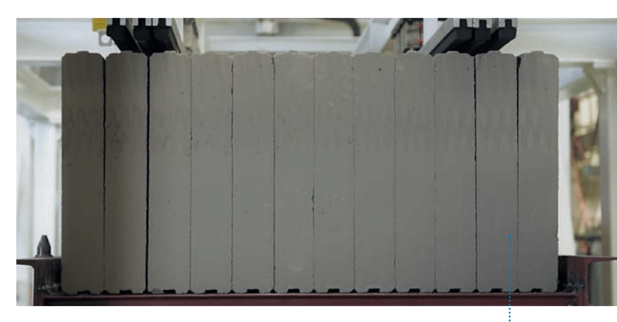
Green cake separation technology by Keda Suremaker.

In this solution, a new green cake separating machine different from the current technology was launched. The green cake separating machine adopts an intelligent electric mode without hydraulics. With the special design of the structure, the machine can separate panels from both sides of the cake synchronously to save time. Flexible and retractable com-