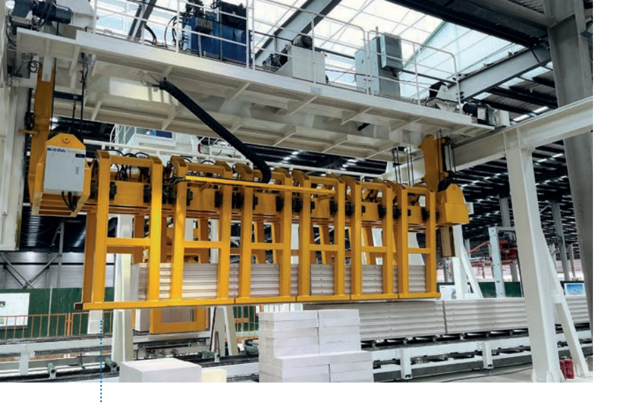
Panel sorting crane in the HGA Anhui plant.