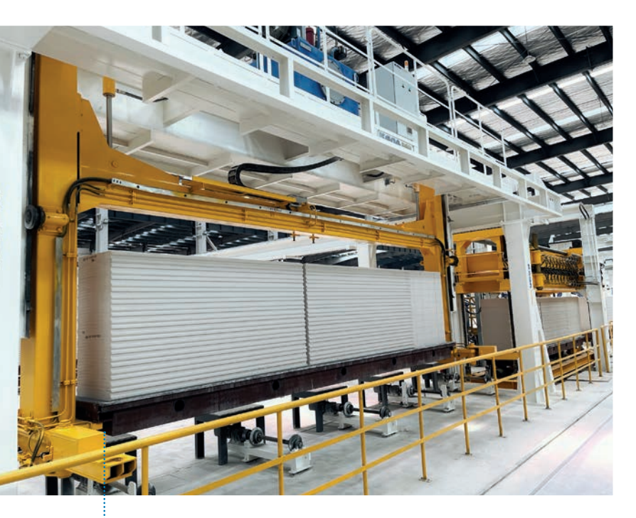
Packing section in HGA Anhui plant.