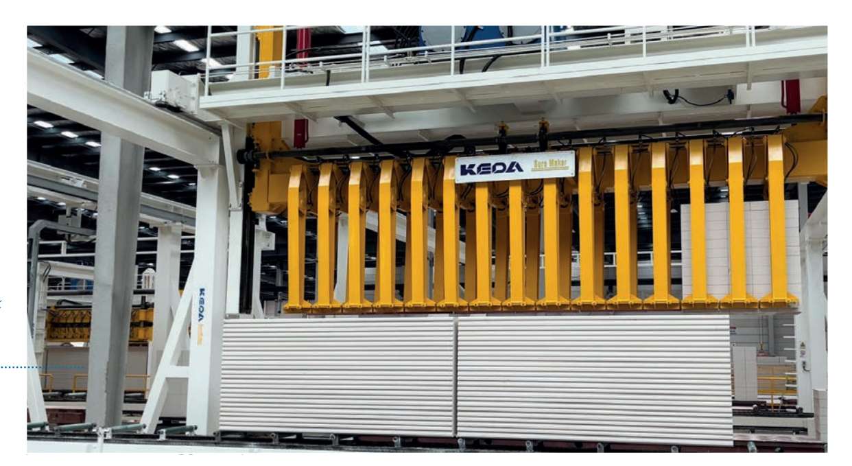
Clamping machine for panel and block transportation in the packing area.

HGA Anhui is an important strategic pivot of the HGA Group in East China. The plant is located in the Sanshan Economic Development Zone, Wuhu City, Anhui Province, China. HGA Anhui plans to produce 800,000 cubic meters of AAC panels and blocks annually, as well as provide integrated services and total solutions for green building systems.