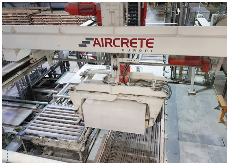
Replacement of the gripper after plant scan enabled heavier products to fit on the pallets