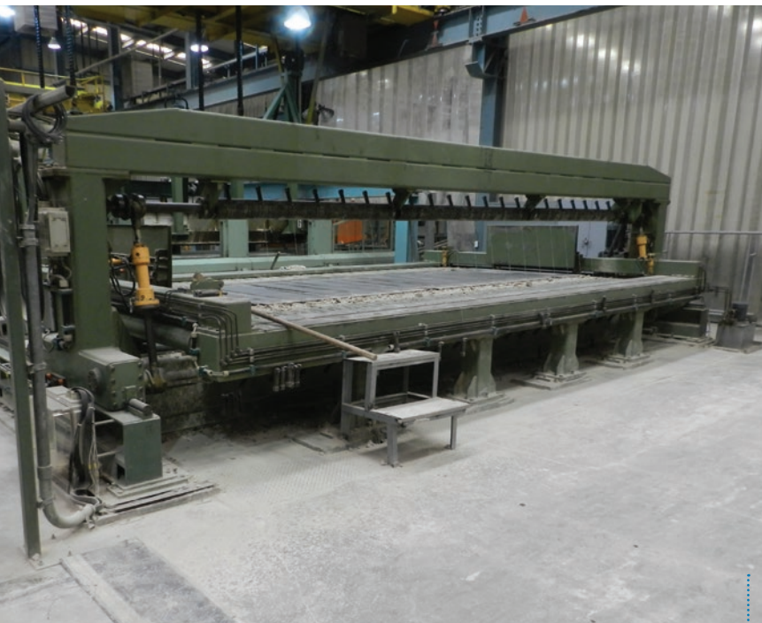
The cutting line was not suitable for products with 5 mm incremental thicknesses and super smooth surfaces