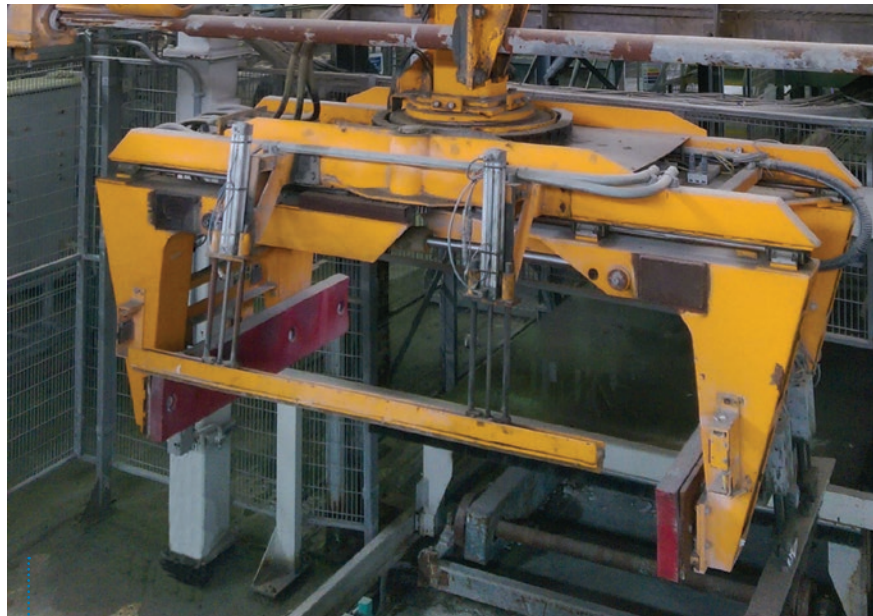
The old gripper on the unloading line was not able to hold new products

The customer received a detailed engineering re-work plan with indicative budgets so that they can choose among options from different solution providers. In the end, the project was outsourced to Aircrete Europe and was delivered in a couple of weeks.