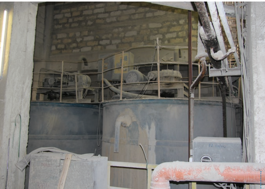
It was hard to keep the slurry density under control through manual measurements