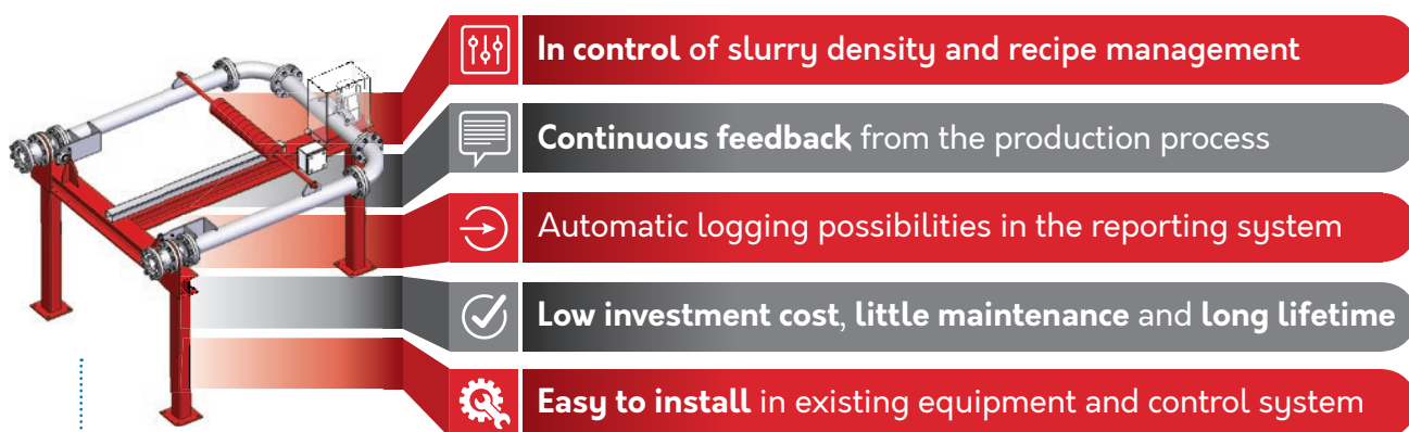
Fig. 2: The benefits of using Aircrete U-pipe for automatic density measurement of fresh and return slurry

are very straightforward (Fig. 2). Furthermore, a significantly lower investment cost compared to other density measurement equipment, effortless calibration and reliable usage with a very long lifetime add to the list of advantages. In addition, the Aircrete U-pipe is very easy to install into an existing AAC plant's equipment by simply redirecting piping and also easy to integrate in the plant's existing control system. The smart positioning of the u-pipe minimizes the risk of possible build-up of slurry in the pipe, and a flushing mechanism allows for flushing during a stop in case required.