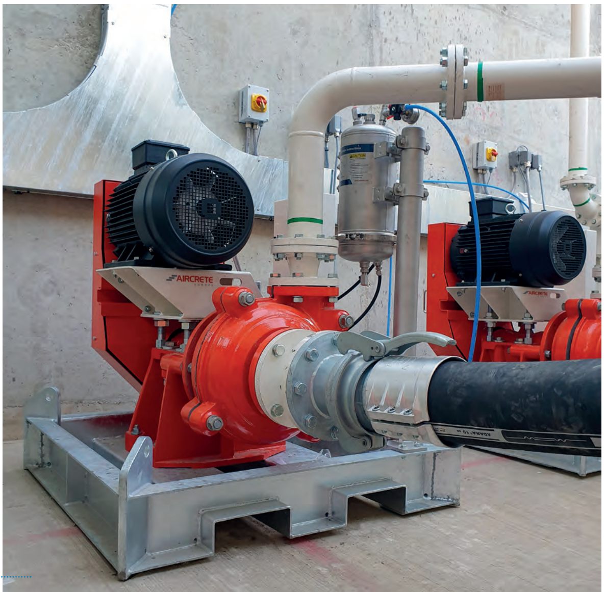
Fig. 1: Slurry pumps handle abrasive high-density slurries in every AAC plant

The AAC industry uses slurry pumps (Figure 1) for decades to pump fresh and return slurry into the slurry tanks and from the tanks into the mixing tower. There are a number of variables in the slurry pump system that are hard to control including the slurry mix (density and homogeneity) and the external sealing. The sealing property is one of the most important factors throughout the life span of the slurry pump. Seals are used in order to prevent leakage which can cause damage to the slurry pump. The challenge here is not to allow large volumes of pressurized slurry to escape, deal with pressure peaks in the system and minimize the entrance of water (used in order to cool the seal) to enter the slurry and cause dilution of the slurry.