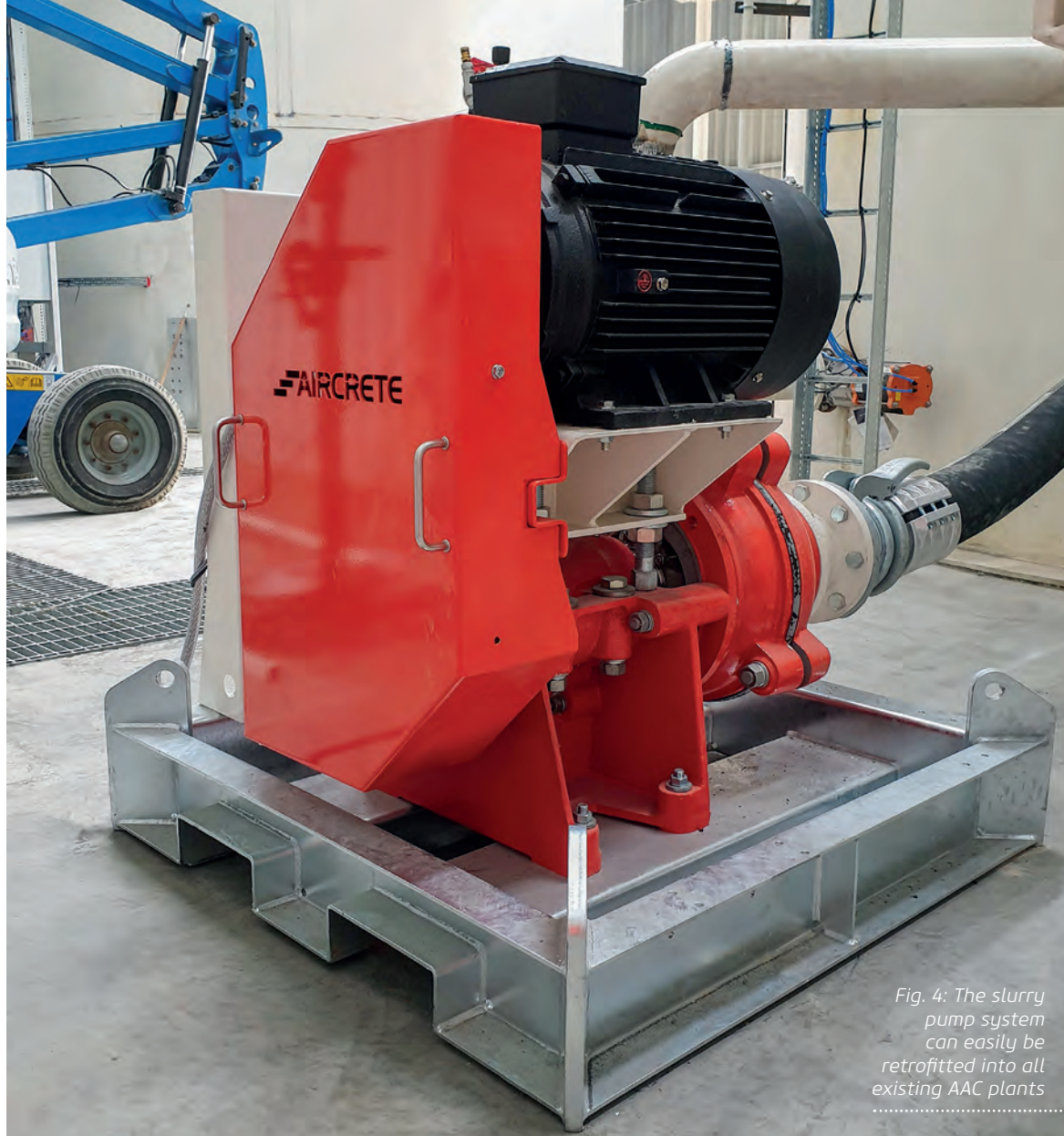
Fig. 4: The slurry pump system can easily be retrofitted into all existing AAC plants

The advantages of the new generation Aircrete Slurry Pump can be summarized as: