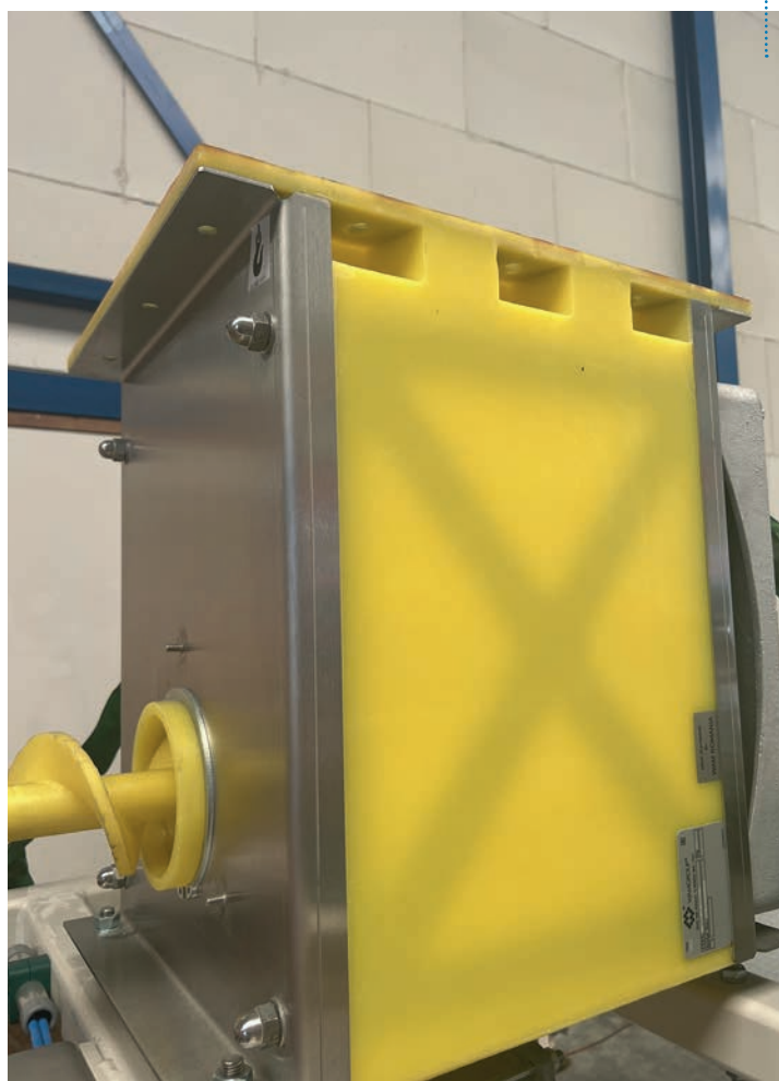
Fig. 2: Outside of the Aircrete special dosing system

aluminium paste with water in large tanks. This did not only require special cooling system, but also reduces the accuracy of the aluminium dosing. Today, the Aircrete Alu System is able to batch-by-batch dose the aluminium paste in a “dry” stage and hereby achieve a dosing precision of \pm 10 grams during a cycle of 3 minutes. The special Aircrete dosing system (Fig. 2) was designed to create the steady flow and eliminate the sticking issue. The brand-new technology of the paste cutoff system can provide highly controlled batch infeed of the Aircrete Alu System mixer. Both the Aircrete Alu System mixer and the main mixer's aluminium weighing bin contain the newest sensor systems, making sure that precisely the needed mass is mixed into the cake. Temperature is controlled on every stage of the aluminium emulsion preparation.