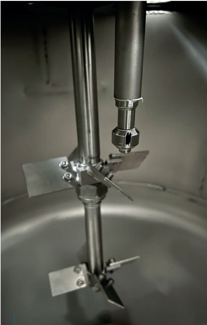
Fig. 3: Inside of the dosing mixer (agitator and pressure nozzle)