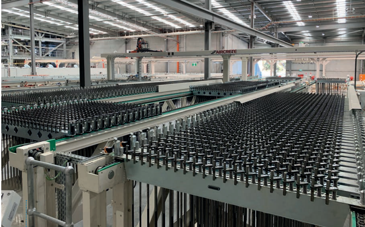
Fig. 4: A magazine of cross bars from which the correct reinforcement frame is configured as per the batch request from the MES

welding machine' will do the job. In addition to the reinforcement preparation, the complication in packing and sorting of finished products is something that is often not well understood, and many times underestimated.