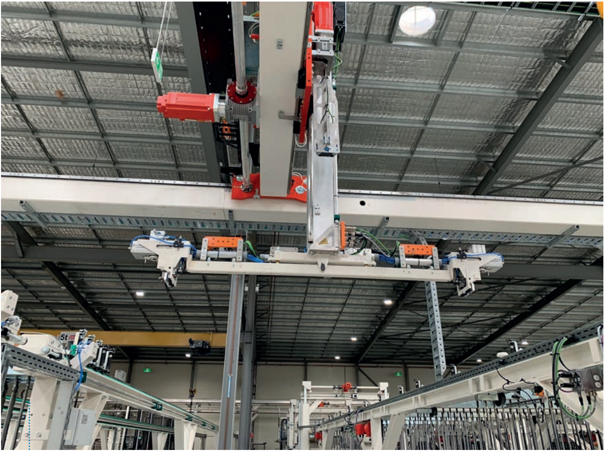
Fig. 5: The multi-axis robot that selects the right cross bar with the right needles