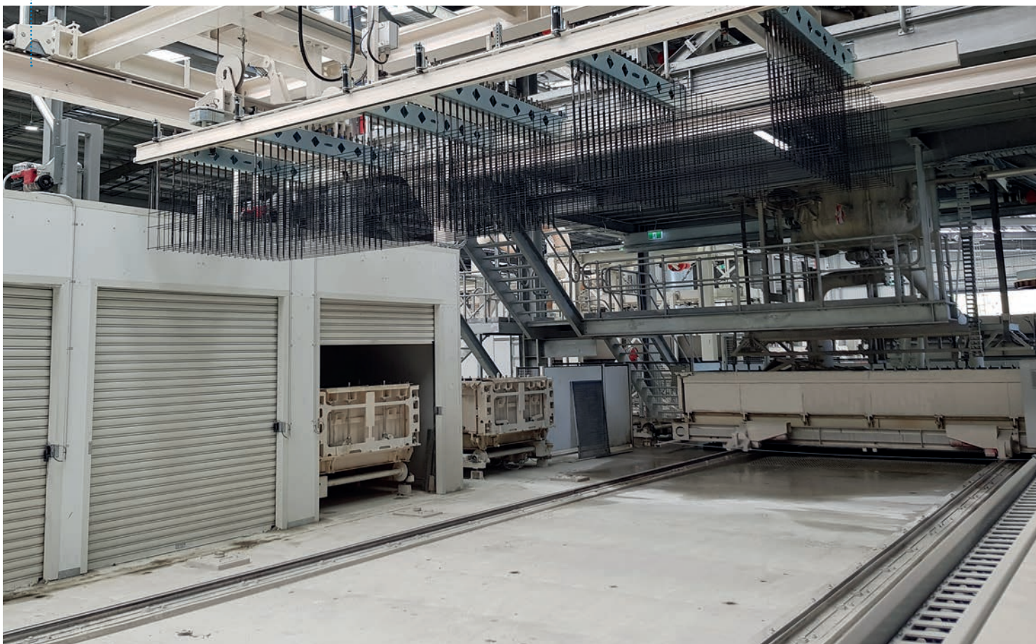
Fig. 7: The reinforcement frame as it travels to be placed in the mould