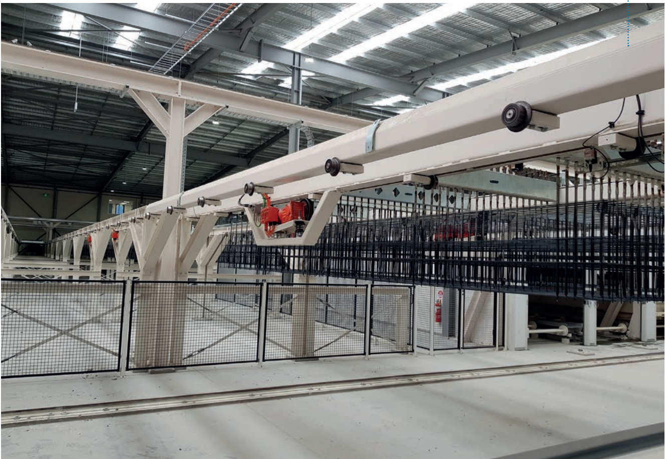
Fig. 6: Reinforcement is automatically assembled on the needles of the reinforcement frames