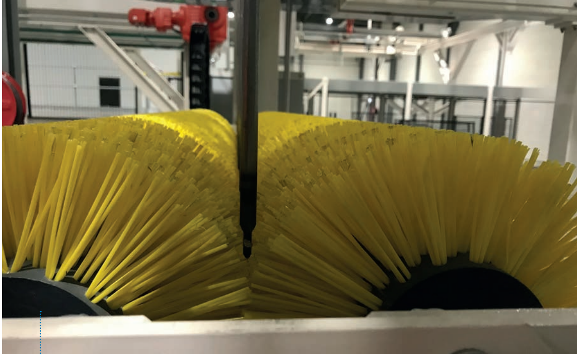
Fig. 9: The automatic needle brushing unit cleans the slurry residue on the needles

Upon re-entry in the reinforcement area, all needles are automatically cleaned, locked (where required) and waxed (Fig. 9). Next, the reinforcement frames arrive at the cross bar robot again which reconfigures, reassembles, or disassembles them according to the requirements for the next batch in line.