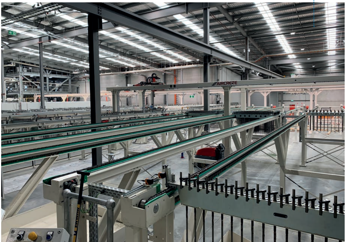
Fig. 3: Multiple handling devices are required in an automated reinforcement area

While producing reinforced products, an extra complication is added to the production process: reinforcement production and handling, while fast cycle rates should be maintained in order not to lose capacity. It is often (falsely) assumed that 'just buying a