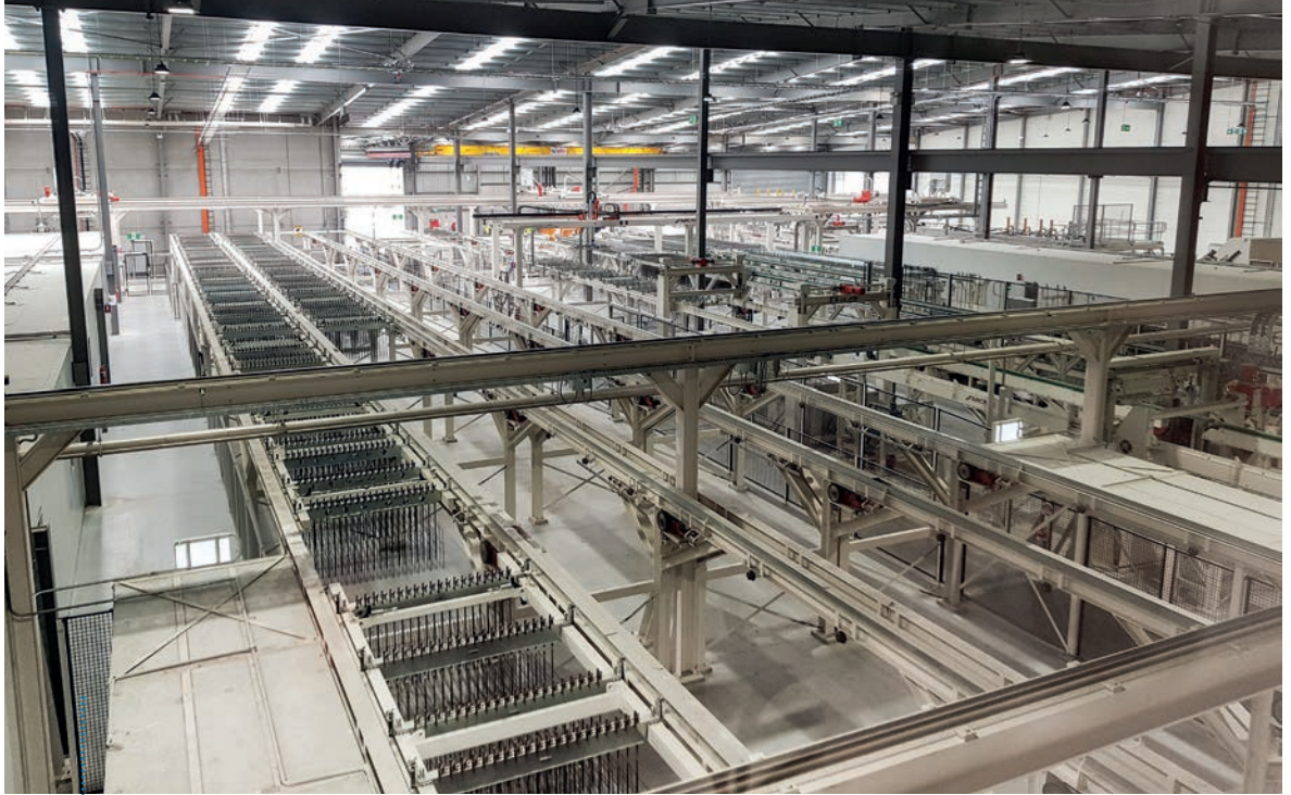
Fig. 2: An overview of the automated reinforcement area