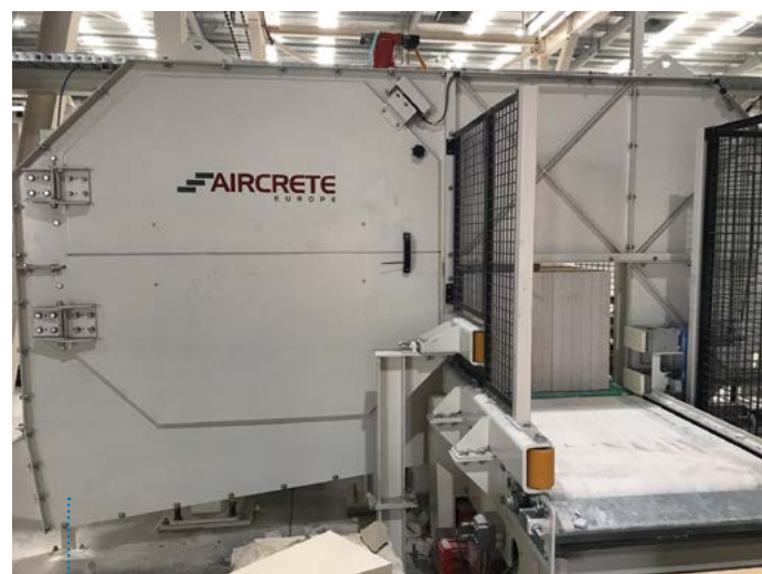
Fig. 3: Damaged ends of 7 cm panel are in the process of being cut off from the full 3 m pack

directly to the stockyard (Fig. 4). In case reinforcement is exposed due to the sawing position, these ends of the reinforcement are then immediately coated with anti-corrosion coating to protect against corrosion.