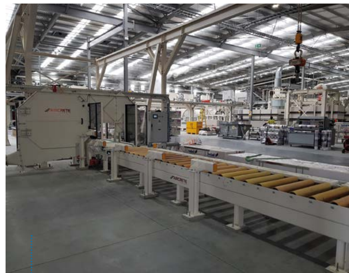
Fig. 4: Overview of the exit side of the system