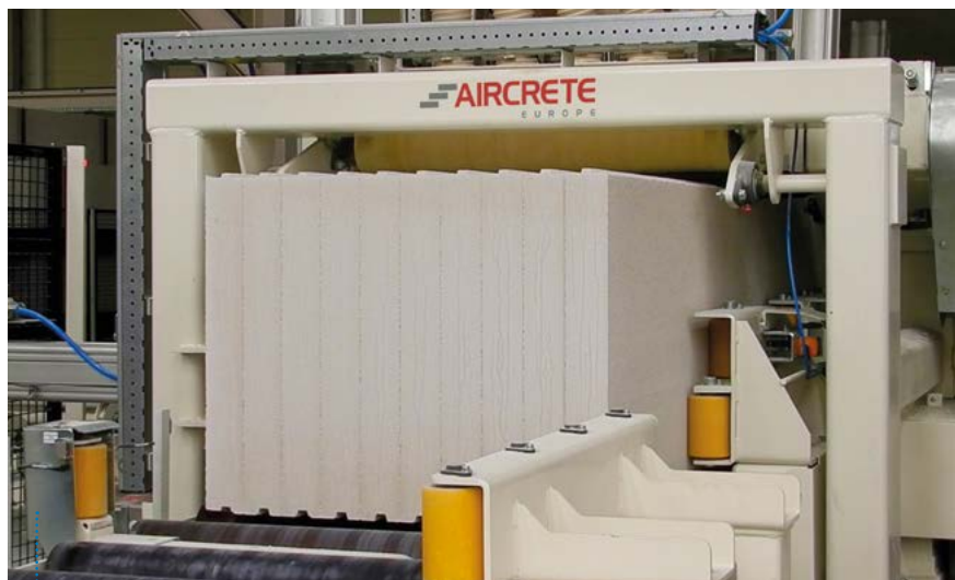
Fig. 2: Fully profiled panels exiting the milling unit