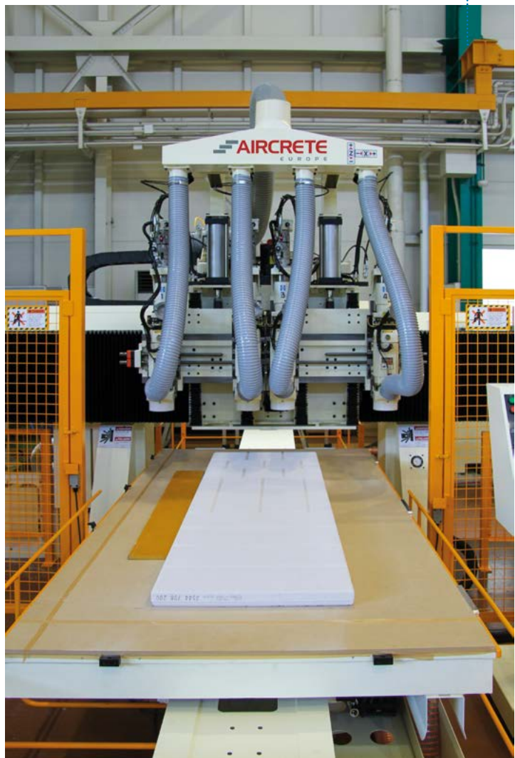
Fig. 6: Aircrete panel milling system can mill two panels at once