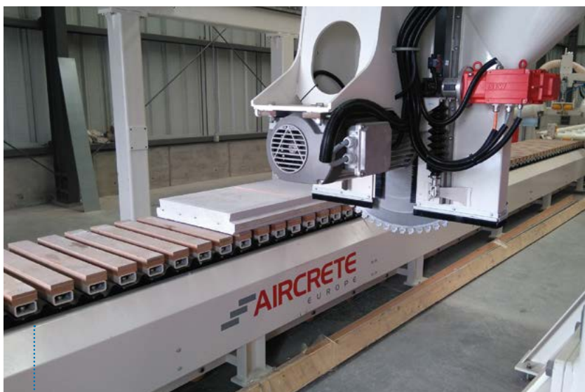
Fig. 8: With the head that can move up to 90°, the sawing machine at Aircrete Mexico cuts the panels in the desired shape