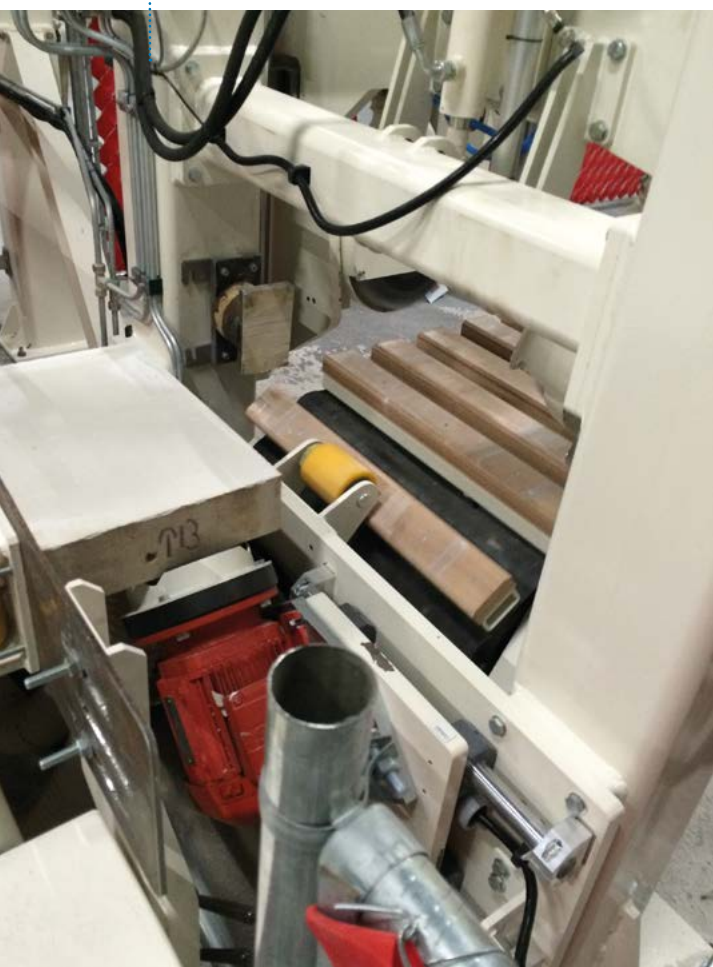
Fig. 9 and Fig. 10: The infeed and outfeed of the sawing line with the dust vacuum suction unit at Aircrete Mexico plant that profiles on the sides of the panels