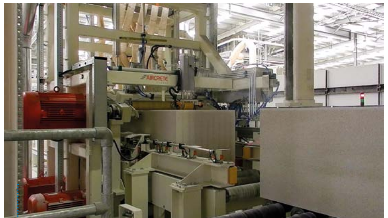
Fig. 1: Panels as they feed into the panel pack milling unit

All the AAC dust is collected and recycled back in the process with a pneumatic transportation system, leading to the separate bin in the mixing tower. In addition, in order to minimize cycle times, this system is installed between the unloading crane and the palletizing of the production process. Special Aircrete Europe conveyor solutions reconfigure the cake to obtain the final pack size and the entire pack of freshly autoclaved, unprofiled panels moves into the white pack milling unit while a movable side roller pushes the pack against the fixed side rollers (Fig 1).