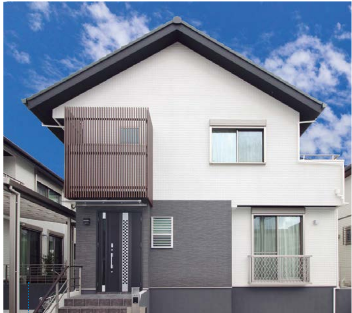
Fig. 5: AAC cladding panels provides a durable insulation layer on outer walls with esthetical appearances

A major advantage of the new generation Aircrete sawing lines is to cut full panel packs at once, however the sawing line for individual panels offers the flexibility to cut panels individually. In this solution, the panels are loaded to the infeed conveyor and they are automatically moved forward to the sawing position first. If panels are vertically positioned, a tilting unit turns them 90°. A gantry with a CNC sawing portal with a diamond pearl blade performs the cut indicated by the operator (cross, longitudinal or angled). Subsequently, the panel is fed out on the opposite end for pick up. Waste parts are collected either manually or automatically using a suction pad crane.