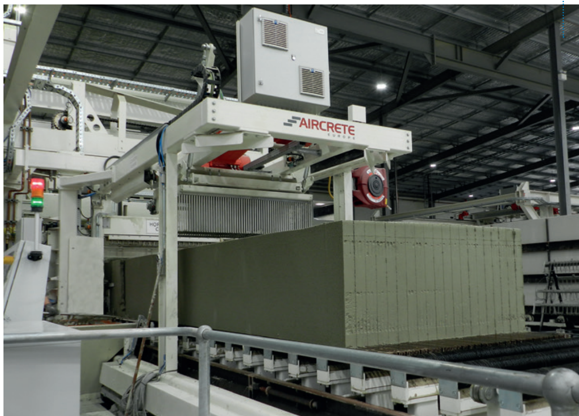
Fig. 4: After the completion of the project, Aercon will be the first factory in the US with the Aircrete flat-cake cutting line

(Fig. 2). Cladding panels are already enjoying significant wall market shares in countries like Australia and Japan (both markets are not coincidentally 100% relying on flat-cake cutting technology for their production), however the United States is also rapidly embracing the thin AAC panel application. Specifically because the cladding application provides a very interesting way of complementing the existing building system (i.e. wood or steel structure) (Fig. 3) with a lightweight concrete, highly-isolative, fireproof and cost-effective shell (i.e. the thin AAC panel).