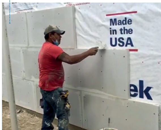
Fig. 2: Thin lightweight AAC panels usage in the form of cladding systems from AAC Build in Texas